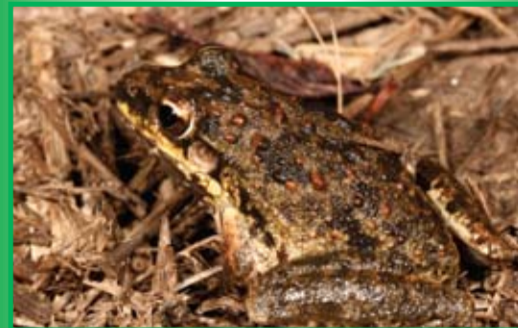
Bumpy Rocket Frog ( Litoria inermis )