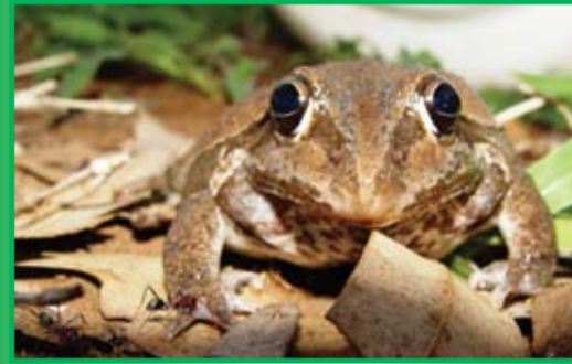
Striped Rocket Frog ( Litoria nasuta )