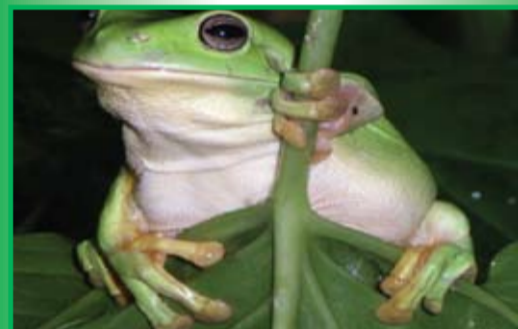
Green Tree Frog ( Litoria caerulea )