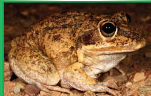
Burrowing Frog ( Cyclorana australis )

e-mail: kimberleytoadbusters@canetoads.com.au phone: 08 9168 2576